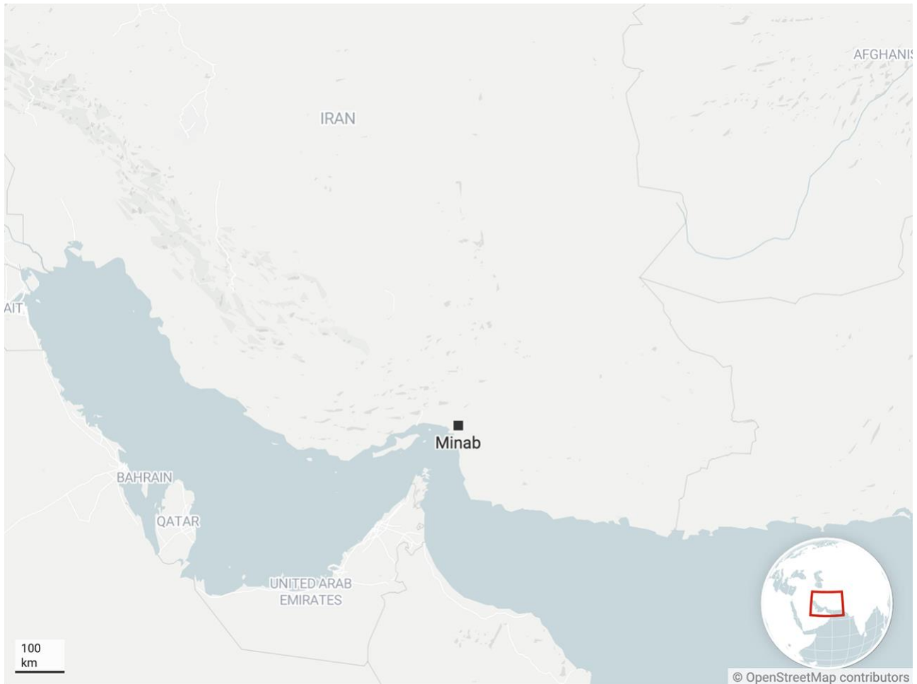
A map showing the strategic geographic location of the city of Minab in Hormozgan province overlooking the Strait of Hormuz, where the targeted military square is located.