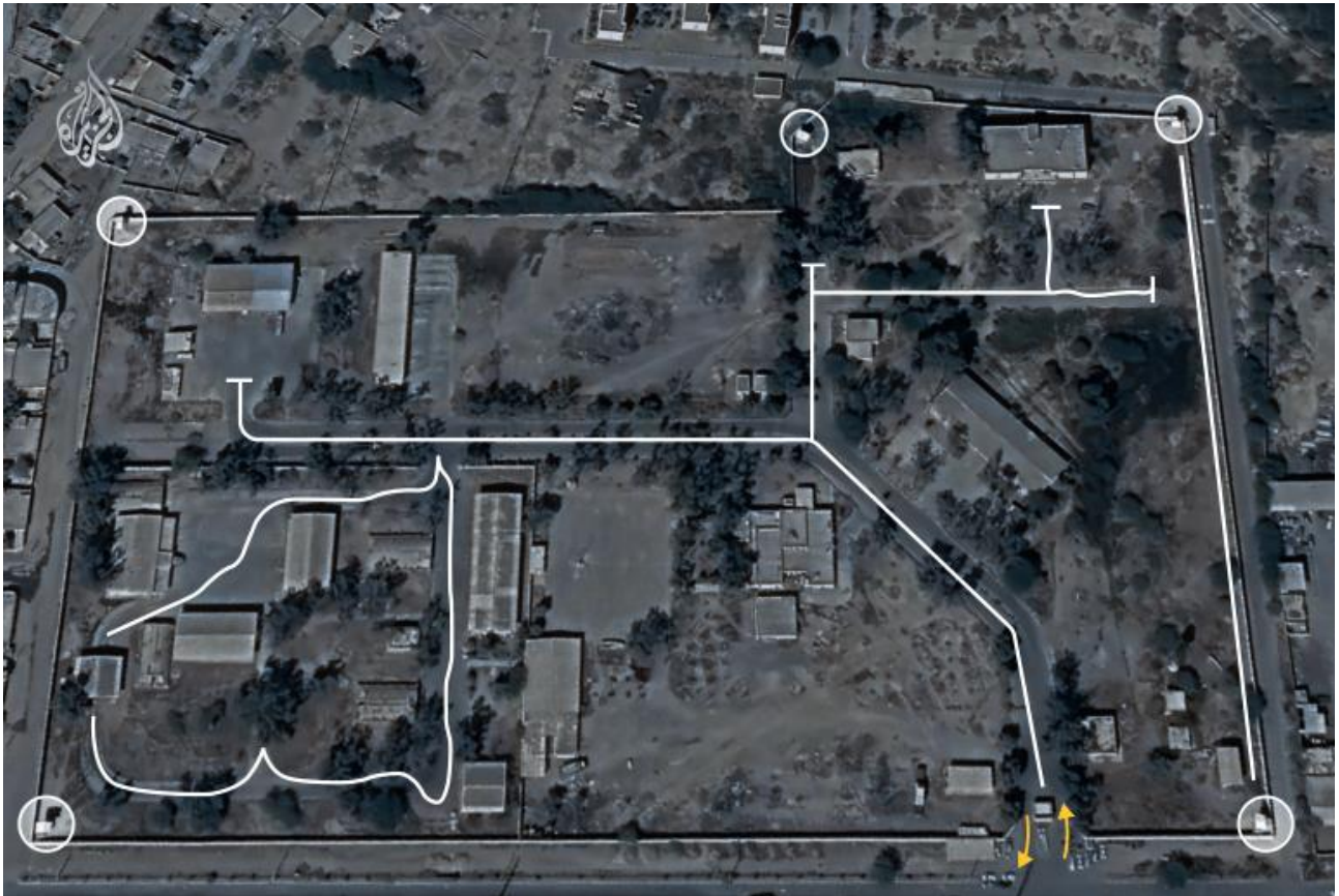
A 2013 satellite image showing the school area as a contiguous part fully integrated within the wall of the Sayyid al-Shuhada military complex and surrounded by guard towers

The images show that the school building and its surrounding area were a connected, integrated part of the main military complex. The outer perimeter wall was unbroken, and the complex was surrounded by five security watchtowers positioned around the corners of the entire compound. There was only one main entry gate serving the whole complex, and the internal road network connected all buildings without barriers.