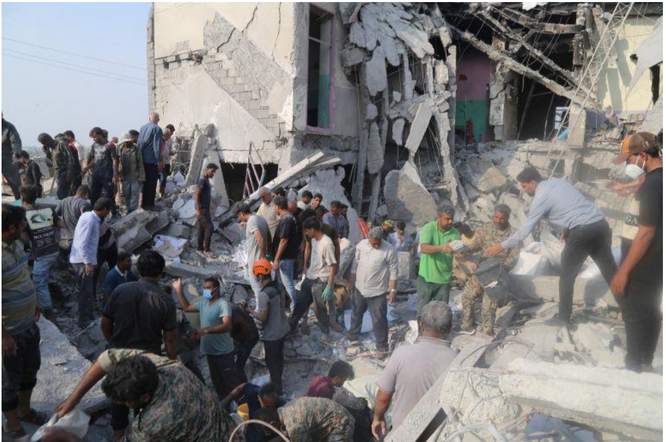
The aftermath of an Israel strike on a school in Minab, Iran

Al Jazeera investigation raises questions over deadliest single attack of war on Iran that killed 165 schoolgirls and staff.