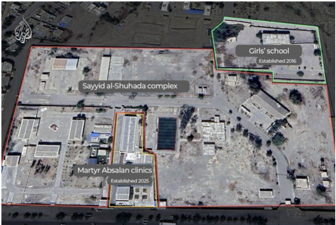
The adjacent Martyr Absalan Specialised Clinic (lower centre, in yellow), which opened in early 2025 and was separated by an independent civilian entrance, and which sustained no damage during the latest bombardment

As with the school years earlier, building the clinic required spatial separation from the military base. After the Martyr Absalan clinic opened in January 2025, a separate gate was opened to connect it directly to the external street to receive civilian patients, and a dedicated car park was established – measures mirroring what the school underwent when it was separated from the complex and given three independent gates.