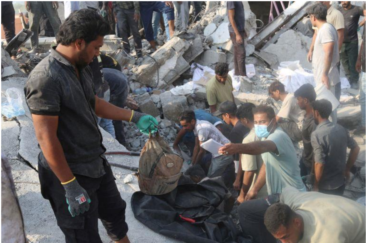
People and rescue teams search for victims following an Israel strike on a school in Minab

In the Gaza Strip, attacks on educational facilities have reached an unprecedented level since October 2023. By the early months of 2025, 778 of the enclave's 815 schools had been partially or completely destroyed – about 95.5% of all schools. UNRWA reported that about one million displaced people sought refuge in its schools, which had been turned into shelters; nevertheless, at least 1,000 people were killed and 2,527 wounded inside these schools through July 2025. Journalistic sources also documented that the Israeli army set up a “special strikes cell” to target schools systematically, classifying them as “centres of gravity”.