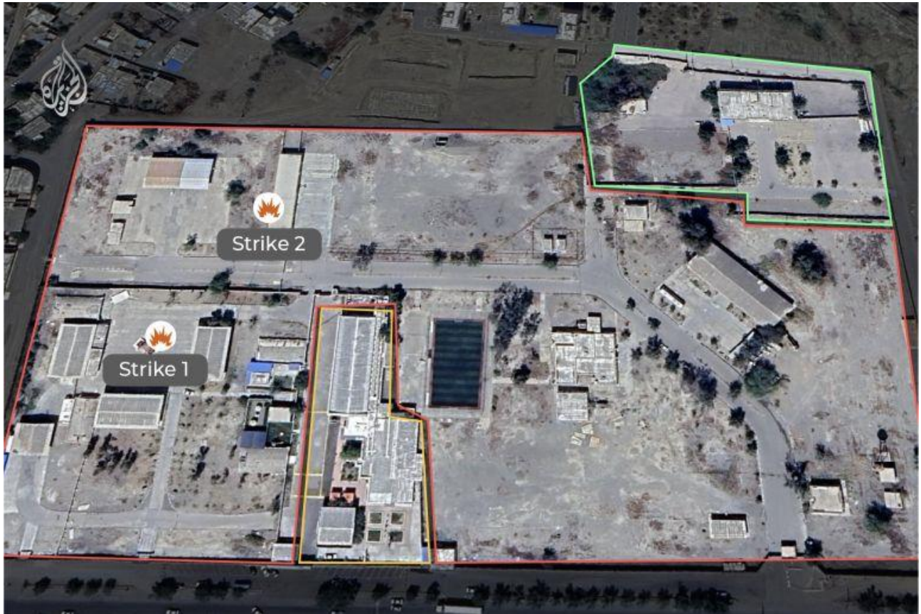
A visual analysis of missile impact sites shows the military base targeted (red area) and the school (green area), while the clinic complex (yellow area) was precisely left intact

Here lies the fundamental contradiction exposed by this investigation: If the intelligence was up to date enough to spare a clinic that had been open for only one year, how did it fail to identify an elementary school that had been separated from the military complex and had become a clearly defined civilian institution for more than 10 years?