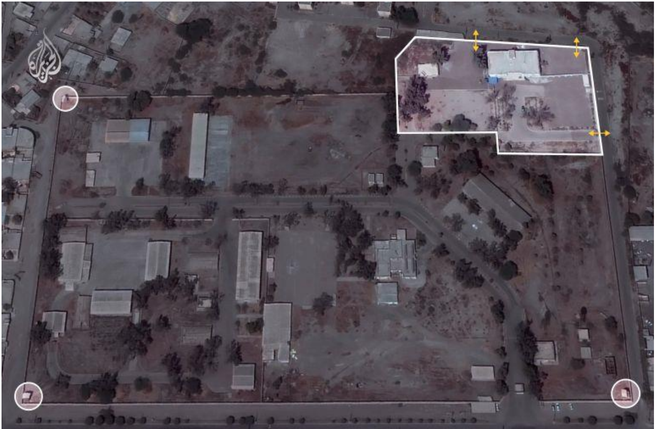
A 2016 aerial shot documenting the radical turning point, as isolating walls were built and three independent external gates were opened to separate the school building from the military barracks

This radical modification documents the construction process and the official removal of the building from the military barracks system, converting it to an independent civilian purpose with dedicated entrances that do not pass through military checkpoints and are 200 to 300 metres (650 to 1000ft) away.