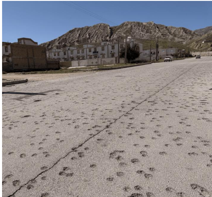
The fragmentation pattern caused by airbursting PrSM warhead.

These “air-burst” missiles detonated in the air before impact, unleashing 180,000 high-velocity tungsten pellets that tore through the area in every direction with devastating force. These missiles are designed and missoned to inflict maximum human casualties.