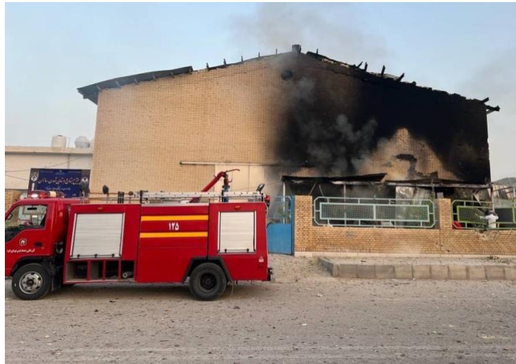
Lamerd's sports hall was struck while girls were practicing volleyball. Two of the girls were killed on the spot by flying pellets.

The new analysis was based on video footage of the detonations, photographic evidence of the damage, a missile trajectory assessment, and the opinions of multiple experts, including some U.S. government officials. The investigation concluded that there were three separate missile strikes on a sports hall, a residential area, and an area near an educational center in Lamerd that involved U.S.-made Precision Strike Missiles (PrSMs).