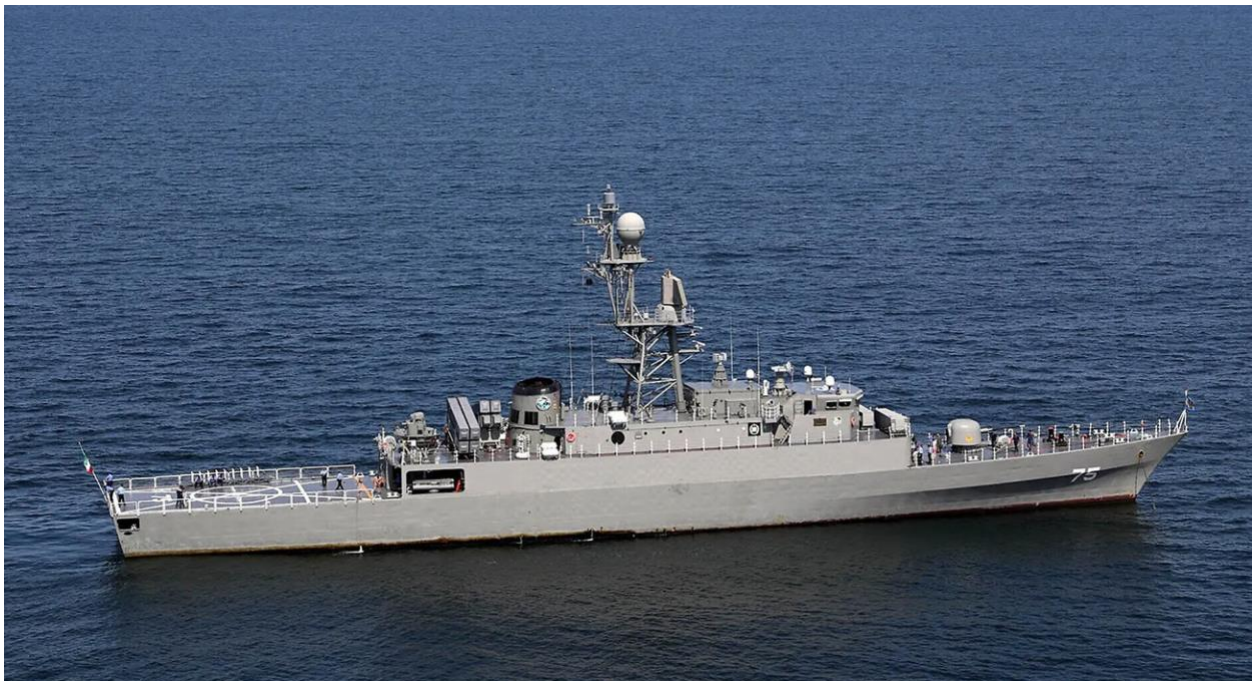
Iranian frigate IRIS Dena

On the morning of March 4, 2026, amid the 2026 war on Iran, at 05:08 Sri Lanka Standard Time (SLST), the Iranian Navy frigate IRIS Dena issued a distress call. At the time, IRIS Dena was in international waters, 19 nautical miles (35 km) off the coast of Galle, on Sri Lanka's southern coast.