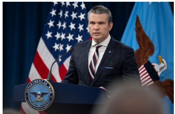
U.S. Secretary of War Pete Hegseth during a press briefing at the Pentagon, March 4, 2026 << watch the video

emphasizing what he described as the operation's historic significance: